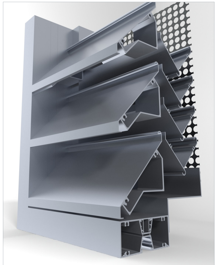
LS200 Double stage louver